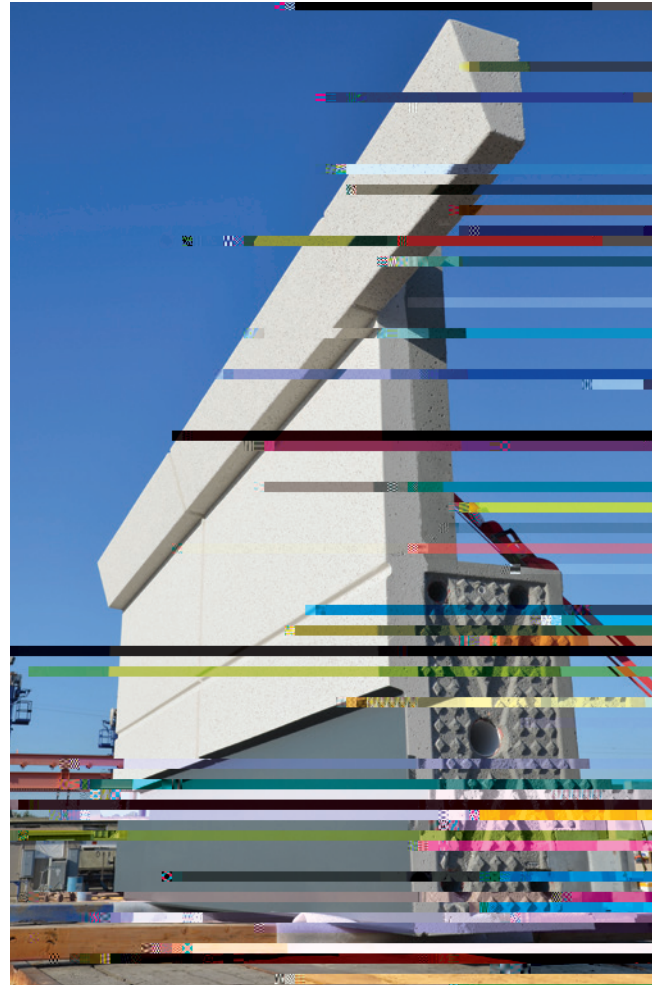
All-in-one where finishes are integrated into structural systems. Enhanced performance and resiliency is provided through the use of the Precast Hybrid Moment Frame.

Clark Pacific's componentized parking solutions are adaptable and flexible. Used for parking today, our systems are ideally suited for adaptive reuse in the future.